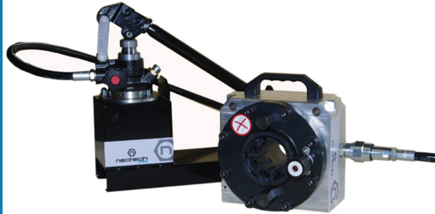
HEAD WITH MAGNETIC SIDE